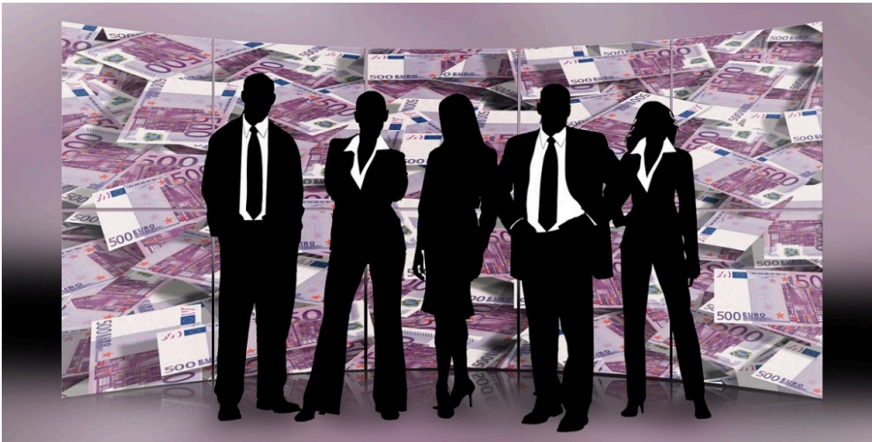
Figure 1.10 A Contemporary Management Team

A group is a collection of individuals. Group-level performance focuses on both the outcomes and process of collections of individuals, or groups. Individuals can work on their own agendas in the context of a group. Groups might consist of project-related groups, such as a product group or an entire store or branch of a company. The performance of a group consists of the inputs of the group minus any process loss that result in the final output, such as the quality of a product and the ramp-up time to production or the sales for a given month. Process loss is any aspect of group interaction that inhibits good problem solving.