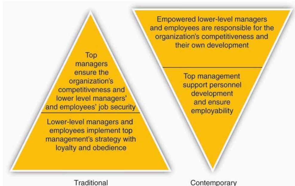
Figure 1.4 The Changing Roles of Management and Managers