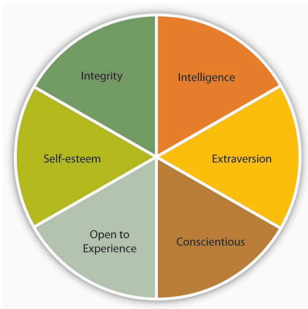
Figure 10.6 Traits Associated with Leadership