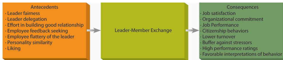
Figure 10.15 Factors Contributing to the Development of a High-Quality Leader-Member Exchange and Its Consequences