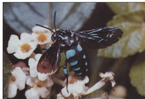
Blue bee. This Thyreus species from the Congo lays its eggs in the nests of anthophorine hosts.

the hidden complexity and gaps in knowledge are astounding. The number of accepted species of honey bees has nearly tripled in the last decade. There are also over 200 species of Bombus , some 400 Xylocopa , and over 1000 Megachile ; and field work is far from complete. Euglossini, restricted to the Neotropics, were thought to consist of some 100 species; intensive recent investigations have doubled the number of known species in the tribe. Except for some highly social forms, bees are relatively scarce (both as individuals and species) in tropical areas. Instead, the highest diversity of species, and, probably, largest numbers of genera and subgenera are found in xeric, warm-temperate regions. But, as Michener