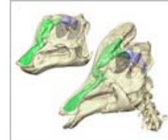
CT scan reconstructions of Corythosaurus ; the nasal cavity is green, and the brain purple. Credit and Larger Version