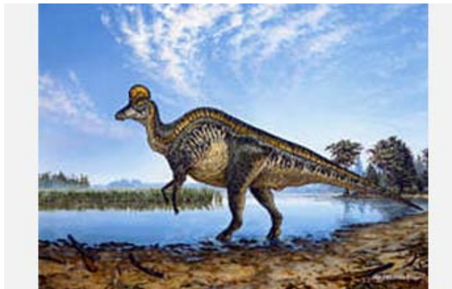
A reconstruction of the helmet-crested lambeosaur Corythosaurus . Credit and Larger Version

High-tech imaging reveals inside of duck-billed dinosaur skulls